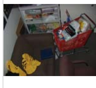
DSC00109.JPG (505k) [View]