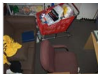
DSC00112.JPG (534k) [ View ]