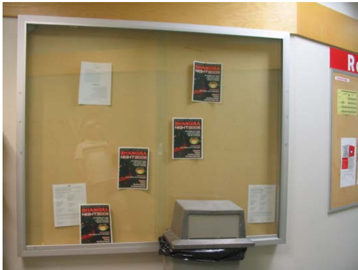
Glassboard near the Surrey KSA office. (Photo by Johnny Woo, 2006-Sep-29)