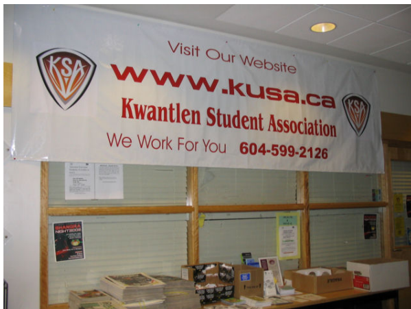
Front (entrance) of KSA Surrey office.