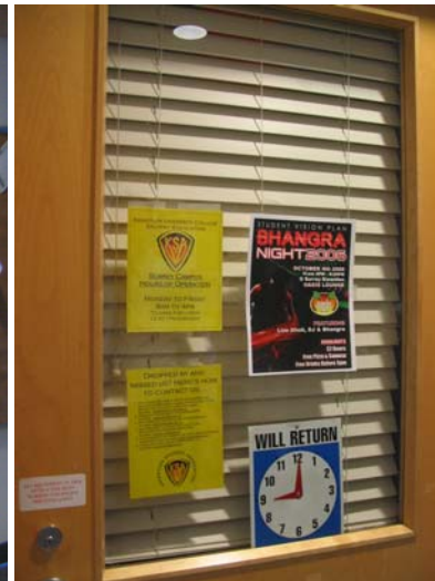
Posters posted behind glass at the front of Surrey KSA office. (Photo by Johnny Woo, 2006-Sep-29)