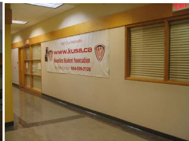
Side hallway